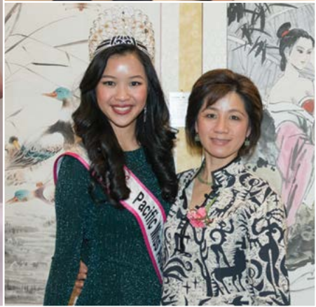
CHINESE RESTAURANT ALLIANCE RENAMING CEREMONY & CHINESE PAINTING EXHIBITION